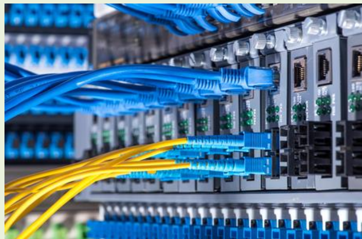
Fiber Optic Cabling